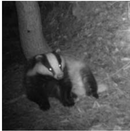
7.45pm, 28 November 2015 – outside the sett in the larch trees

The next day the cameras were recovered and we were pleased to find they had captured lots of wonderful badger behaviour. The camera filming the sett in the larch trees was particularly fruitful, with clear footage showing one plump badger doing an awful lot of scratching and yawning before meeting a second badger and spending some time grooming each other. The camera at the sett with the large spoil heap again picked up at least two badgers poking their heads out of the main entrance. None of the badgers were wearing radio collars although we would have expected these to have fallen off by now anyway. It's highly likely that at least some of the badgers are the original cubs released in 2013. All in all we had a fantastic sett-