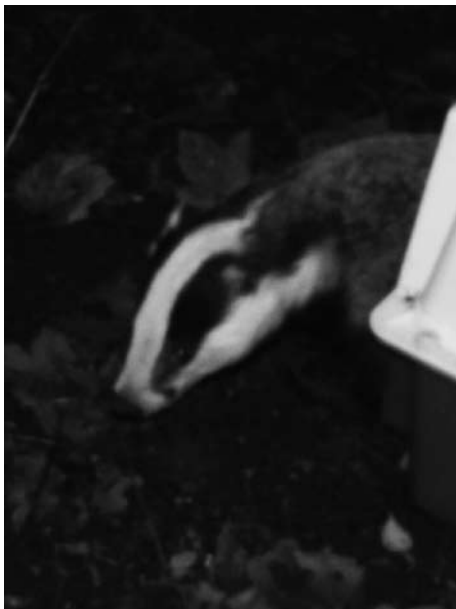
"This time he seemed more interested and pushed his nose out."

An injured badger was delivered to Wildlife Aid with some injuries but none serious. It was delivered by an RSPCA officer with only