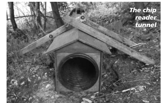
The chip reader tunnel

In June 2015 the trail cameras showed that there was a mother and two cubs in residence at the large sett where as many as four radio-collared badgers had been picked up staying on the same night. The chip reader tunnel was placed there in July and videos recorded an adult and a cub passing through it.