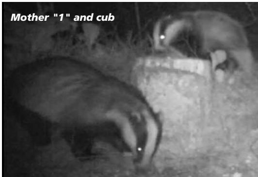
Mother "1" and cub

As an aside to the badger release project but still in the area, in June 2015 a Wildlife Aid rescued female was released into a small sett about 350 metres from the original project release sett. The animal had been micro-chipped in case she should pass through the chip reader tunnel at any point in the future. A camera was left at this sett for two weeks and showed the badger still there with other adult badgers passing by alone or as a pair. The sett was last checked at the end of November 2015 and looked unused. Maybe this recently released badger will pass through the chip reader tunnel some time in 2016 and also be identified?