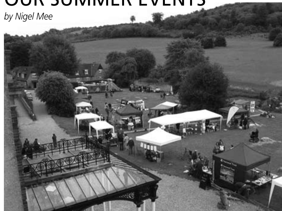
Field Studies Council, Juniper Hall

The West Surrey Badger Group has been represented by sales stalls at two wildlife events so far this year, with a third planned at the end of July. We are keen to have a presence at these events but it's not just a case of selling things. It's a great opportunity to meet and talk to people about badgers and their concerns for them, to educate children about badgers, to network with supporters and maybe sign up new ones, to interact with and learn from other wildlife, nature and environmental organisations, to meet old friends and make new ones, oh and yes hopefully raise a few quid . . .