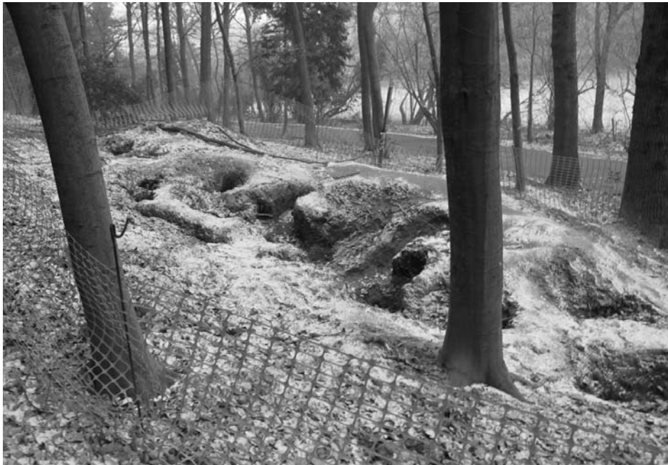
As the snow melts, the full damage is revealed.

What next then? The Police have been pretty good, if a little slow due to pressure of work. They have spoken to the Fire Brigade, who now have procedures in place which should hopefully prevent a repetition of the incident, and have secured their agreement to provide the manpower to undertake restorative work, as to which more in a moment. Also, we understand that the dog owners concerned have been given “words of advice”.